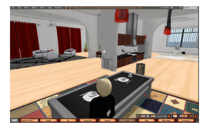
Figure 2. The interior of an I-FLEG house.

The game responds through messages displayed in the Head-Up Display (HUD, Figure 3) which acts as a virtual tutor guiding the player throughout the game. The upper part of the HUD shows information about the current state of the game, the score of the player and the elapsed time. The main window in the center of the HUD is used for guiding the navigation of the learner through the game world, for communicating learning exercises to the learner, and for conveying feedback information. The menu on the right lists the grammar topics (also called teaching goals) that can be exercised in a given session. The content of this menu varies with the language proficiency of the user. Finally, on the bottom right corner of the main window, the "start evaluation" button can be used at any time to switch to evaluation mode.