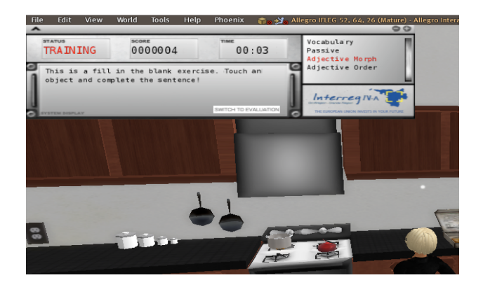
Figure 3. I-FLEG Game Hud.

We differentiate between the navigational instructions generated by the system to guide the user through the different phases of the game and the system feedback on learner input. The system uses English as a language for guiding the user though the game and for explaining training activities but French, the target language, for feedback messages and error correction.