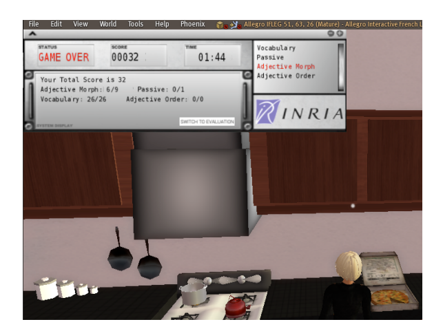
Figure 7. The final score

The same input by an intermediate learner will score no point however as will an input by a beginner which fails on the current teaching goal such as here. "Jean est un garcon petit" where the "adjective order" exercise is incorrectly handled by the learner.