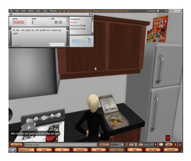
Figure 6. Example of user/system interaction during the training phase.

The numerical feedback is used to quickly give the player an idea of her performance and to enhance the game feeling as well as to evaluate the learning progress. It is based on a structured datatype mapping learning performance to the credit points the learner scores while playing. Recall that the game can be played both in training and in evaluation mode. While in training mode, the score is used only to motivate the learner and give her an idea of her level; in evaluation mode, the score is exploited to update the learner profile and when appropriate, to upgrade her to a new level. In both cases, the score is systematically displayed to the user both during playing and at the end of the (training or evaluation) session. As shown in Figure 7, the system shows the learner the achieved credit points as an indication of her performance for each of the teaching goals that have been evaluated or trained.