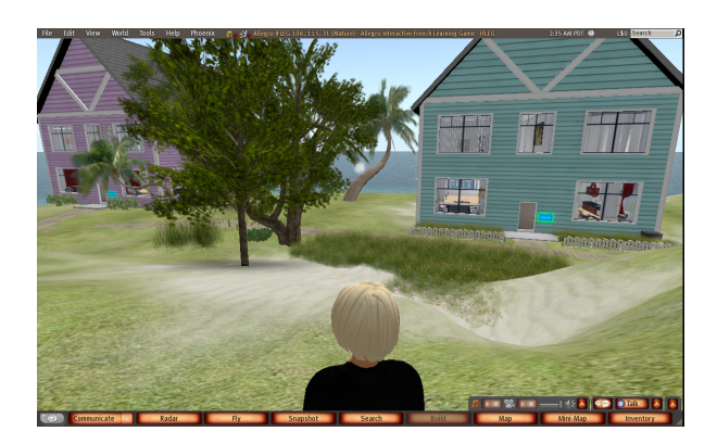
Figure 1. The I-FLEG Island.

A first person perspective is used whereby the learner is an avatar that can freely move in the game world. In order to start the game, she enters one of the houses where she can then interact with the 3D world by clicking on objects and entering text in a chat box.